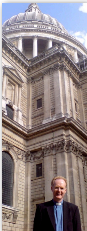
Alastair at St Paul's