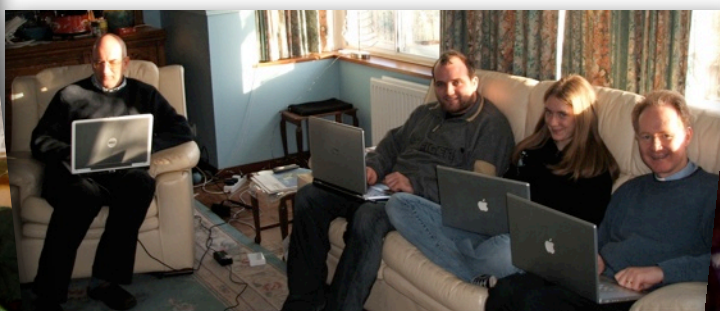
Who needs to talk when we can email?! with the Greenhalgh boys