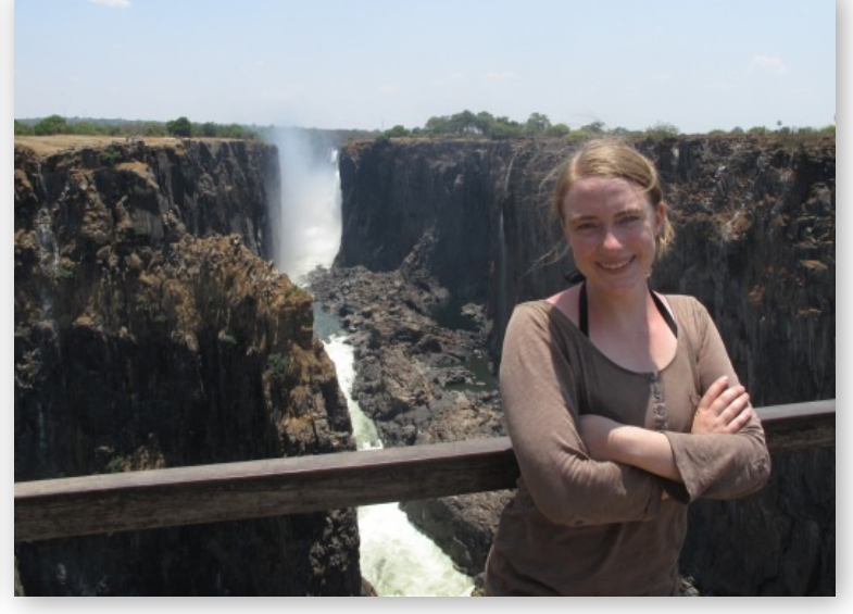
At Victoria Falls